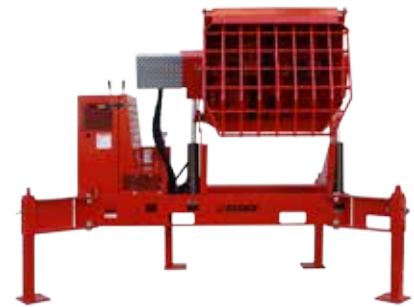
PRO12 - retractable, swing away stabilizers adapt to application requirements.